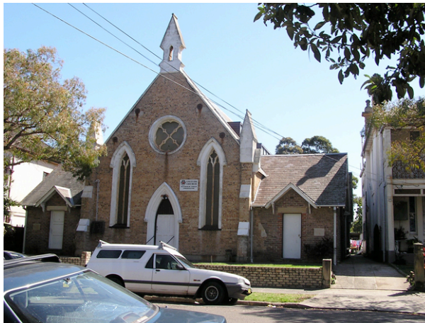
Figure 4.5 The former Petersham Congregational Church is a Federation Gothic church – with an uncommon symmetrical design.