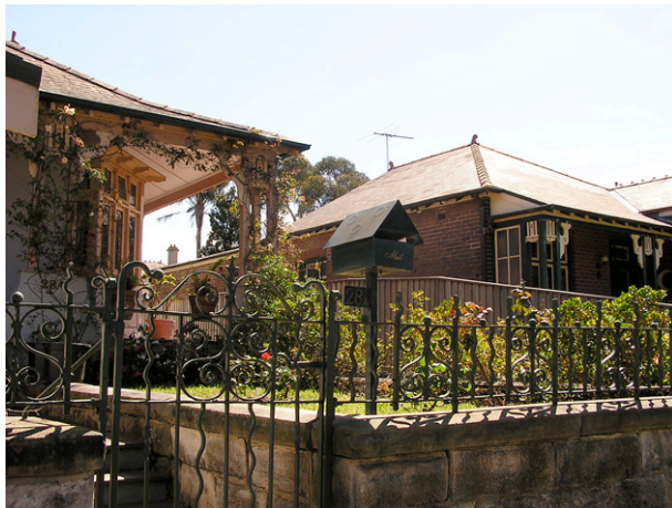
Figure 4.11 Pair of good Federation cottages with detailing and finishes rare in the Marrickville area. The garage in the front garden of one is an unfortunate element in the local streetscape.