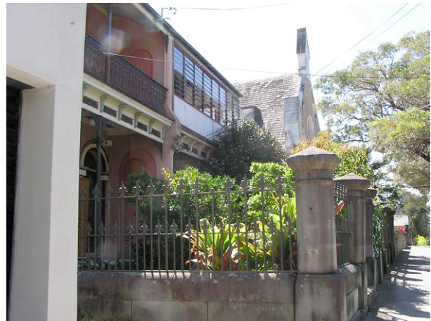
Figure 4.6 Many of the buildings in this group are set well back with a small front garden. The original iron palisade and sandstone pillar front fences make a very important contribution to the significance of the aesthetic values of the area.