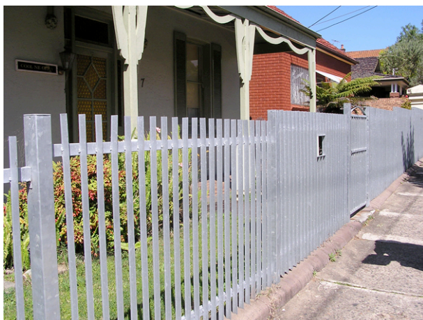
Figure 4.13 A contemporary interpretation of the original iron palisade fence. The proportions and close spacing of the bars however has led to a loss of the original transparent quality when viewed from the footpath.