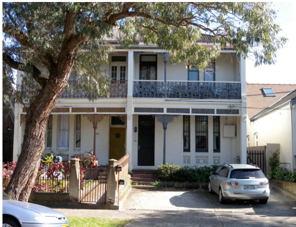
Figure 4.3 Terrace pair. The garden and original iron palisade fence of one of the pair has been removed and replaced by carparking.