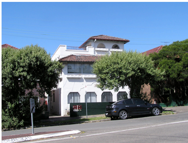
Figure 4.7 The 1930s Spanish Mission style is rare in Marrickville. This block of flats was originally one of a pair, its partner being demolished in recent years. The inclusion of upper level arcades and rooftop terrace reveals an understanding of the nuances of this style by the original architect.