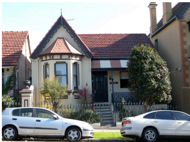
Figure 4.15 Modest freestanding Victorian Italianate cottage