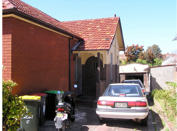
Figure 4.9 and Figure 4.10 This cottage has been layered by the addition of a red texture brick facade in the post-war years. The original Federation cottage can still be seen behind the addition.