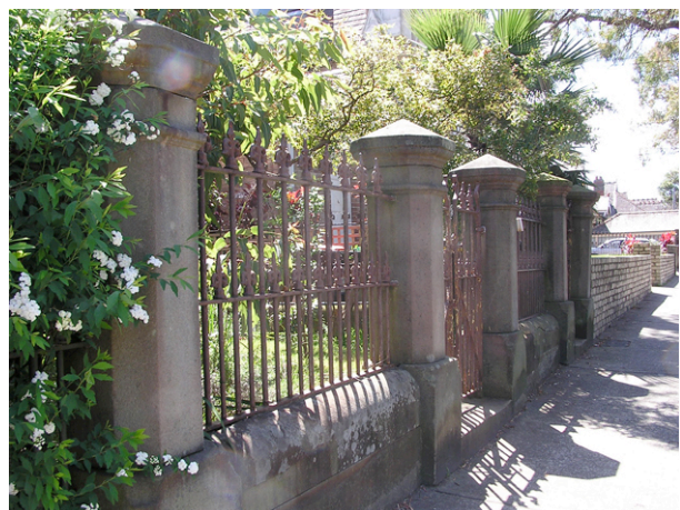
Figure 4.14 Original iron palisade fence with sandstone block pillars.