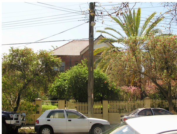
Figure 4.16 The conservation area extends along the northern side of Croydon Road to include the similarly scaled and sited properties. It also includes a highly intrusive residential flat development.