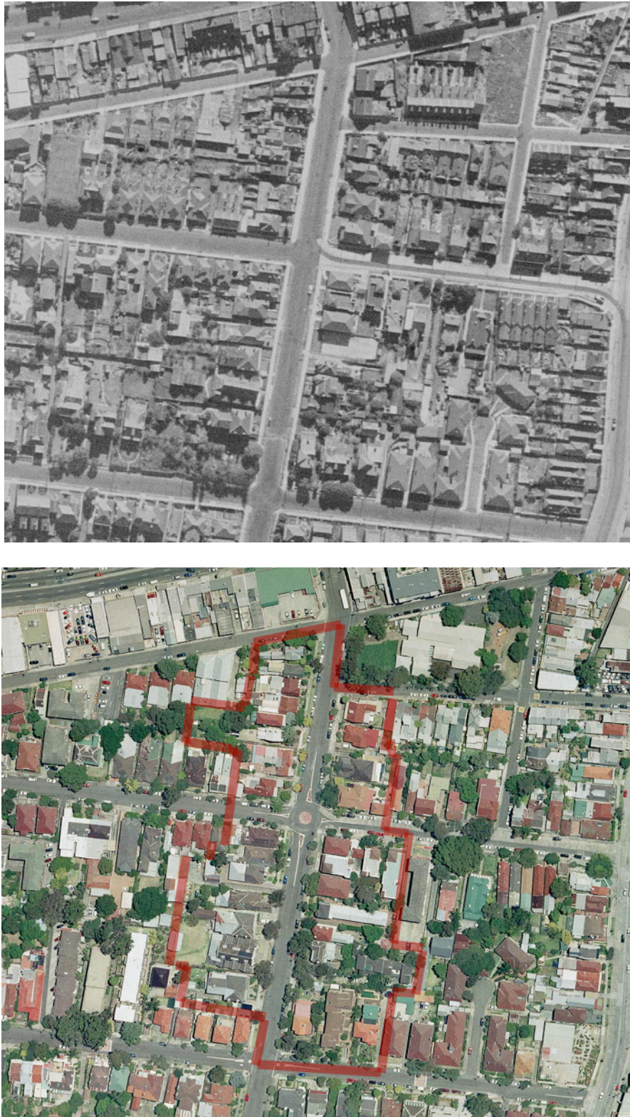
Figure 4.2 The Area in 1943 and 2009

The Railway Street Heritage Conservation Area is located in north Petersham between Parramatta Road and Croydon Street; and between Palace and Crystal Streets.