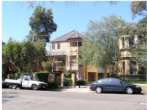
Figure 4.12 Recent infill development has attempted to reflect the faceted bay window of the adjoining Victorian villa but the proportions have been manipulated unsuccessfully.