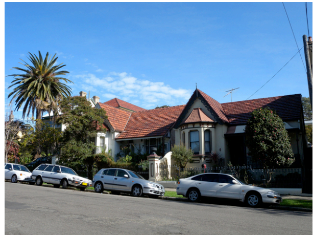
Figure 4.4 Victorian Italianate cottage pair with prominent palm.