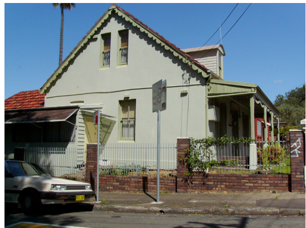
Figure 4.8 Modest Victorian vernacular cottage in substantially intact condition. Alterations and additions have been achieved in a sensitive manner or are readily reversible.